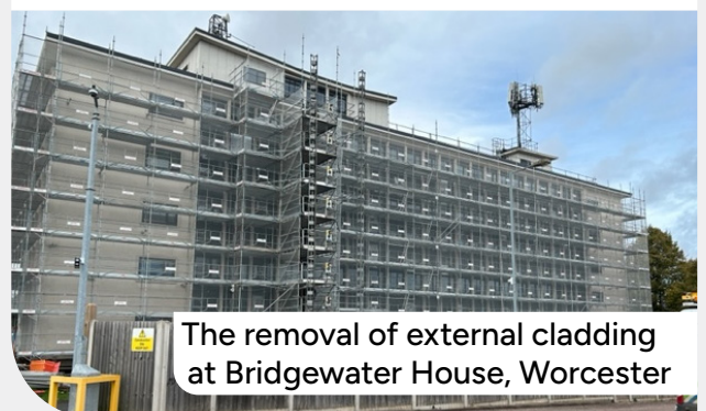
The removal of external cladding at Bridgewater House, Worcester

Whilst Herefordshire and Worcestershire have only a handful of high-rise buildings, HWFRS have been committed to addressing the recommendations made in the subsequent inquiries.